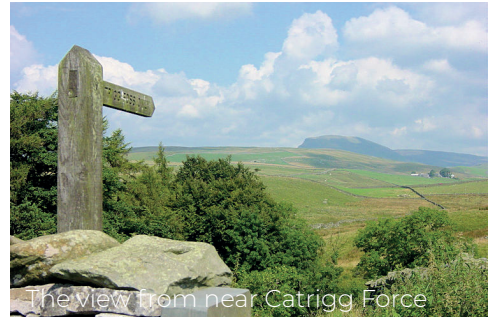
The View from near Catrigg Force