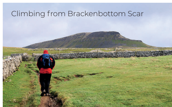
Climbing from Brackenbottom Scar

Head down from Pen-y-ghent on the due west path and if you can take the time to visit the brilliant sink hole of Hull Pot (map ref SD824747) near to where the Pennine Way is crossed. As you approach the pot you wonder where it is but then the sound of the water leads you in. Be careful as it opens up very quickly in front of you to reveal the abyss below.