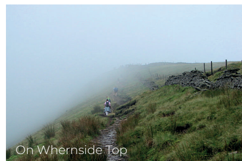
On Whernside Top