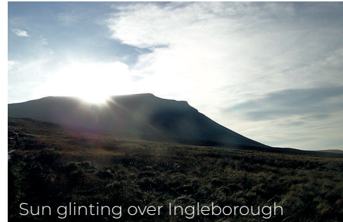
Sun glinting over Ingleborough

On the table top plateau of Ingleborough itself you will be blessed by, weather permitting, brilliant views including hemsides, all of Ribblesdale including the viaduct, a panorama of the Dales and on a good day the hills of the Lake District too. While you celebrate the achievement of capturing the Three Peaks do not forget there is still some six miles back to Horton, all downhill and on the route back are some great examples of Limestone Paving.