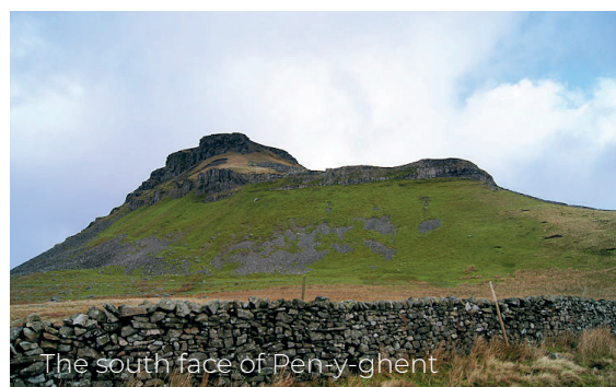
The south face of Pen-y-ghent