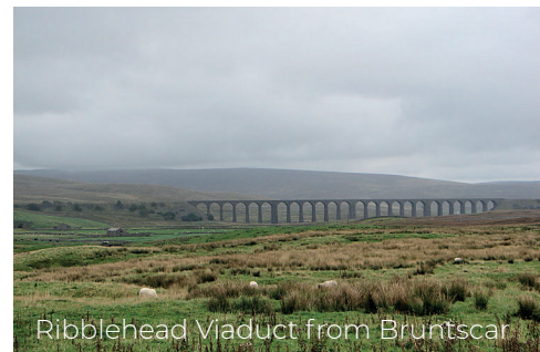
Ribbleshead Viaduct from Bruntscar