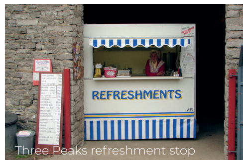
Three Peaks refreshment stop